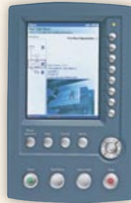
The PacPilot™ user interface is just one of the DI 900 's several innovative features.