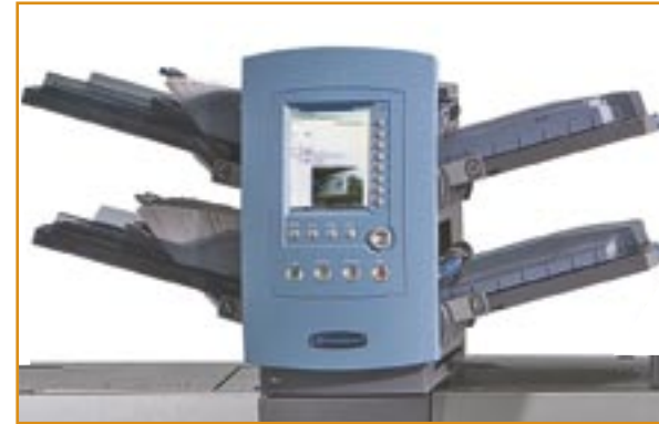
Flexible Tower Feeders

The FastPac™ DI 900 offers a higher level of flexibility in the range of applications that can be run.