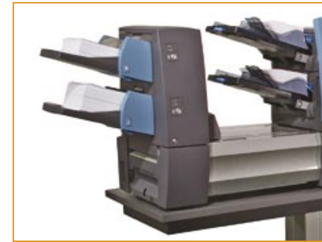
High capacity sheet feeders

Flexible tower feeders have interchangeable trays allowing for any combination of different sized sheets and inserts. This means you can run a wide range of jobs with fewer feeders, which combined with the tower configuration, gives a smaller footprint. Feeders can be linked to increase running time.